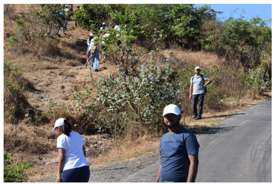
THE TREKKERS FROM GITA INSTITUTE