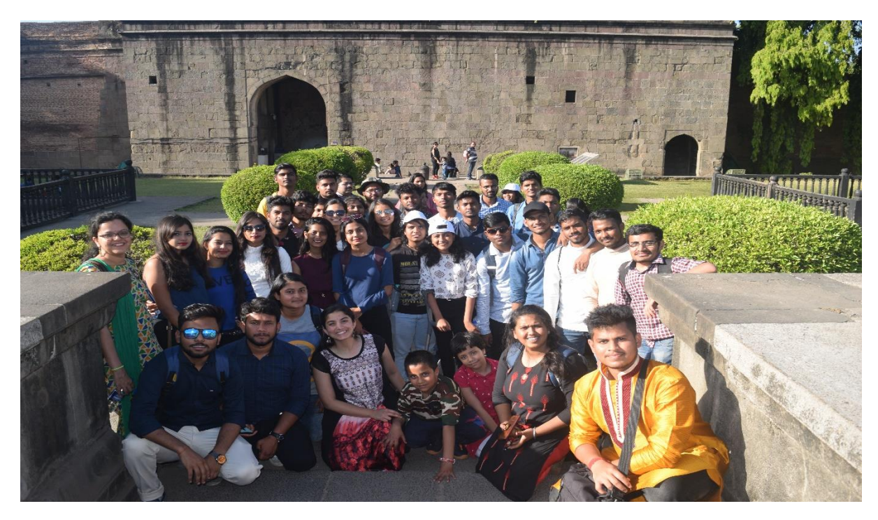
Shaniwar Wada, Pune