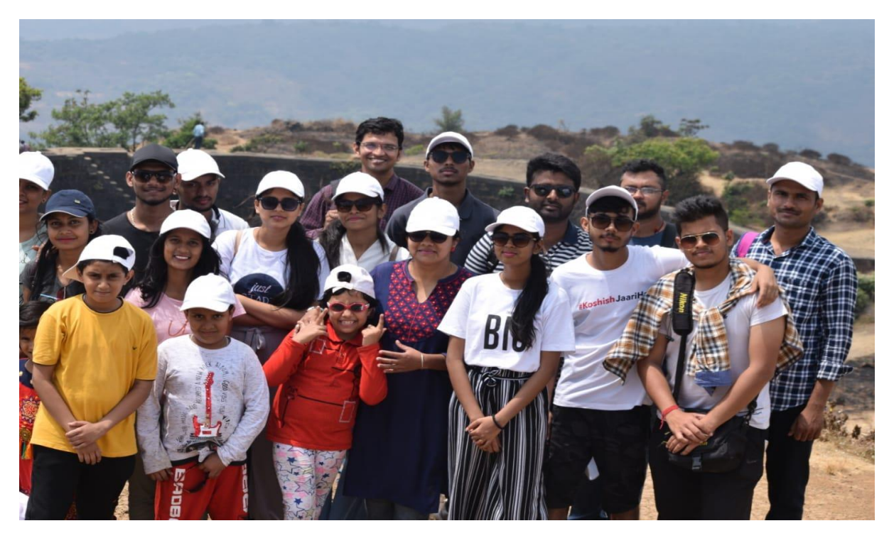
GLIMPSE FROM LOHGAD FORT