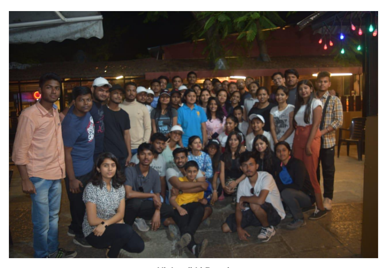
Vishnuji ki Rasoi