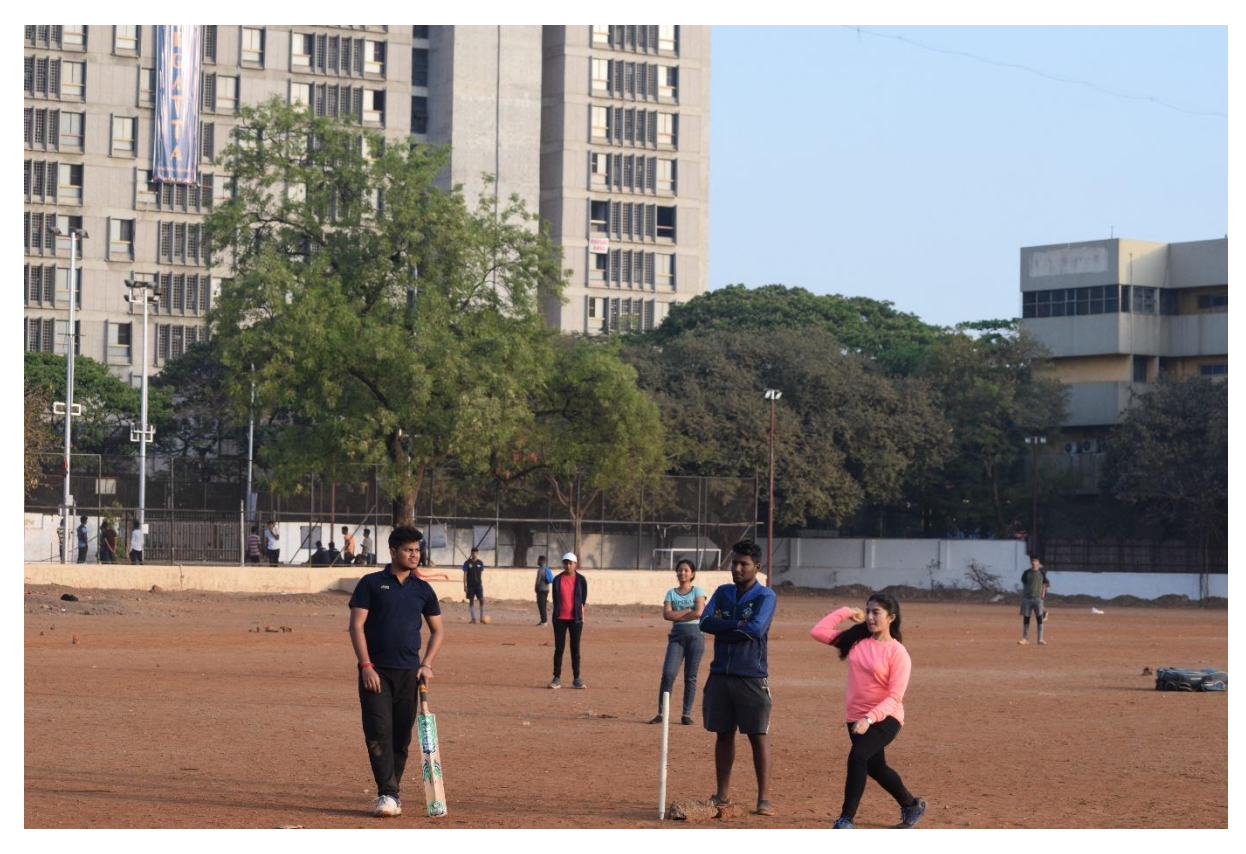
Cricket Match Between COEP and GITA