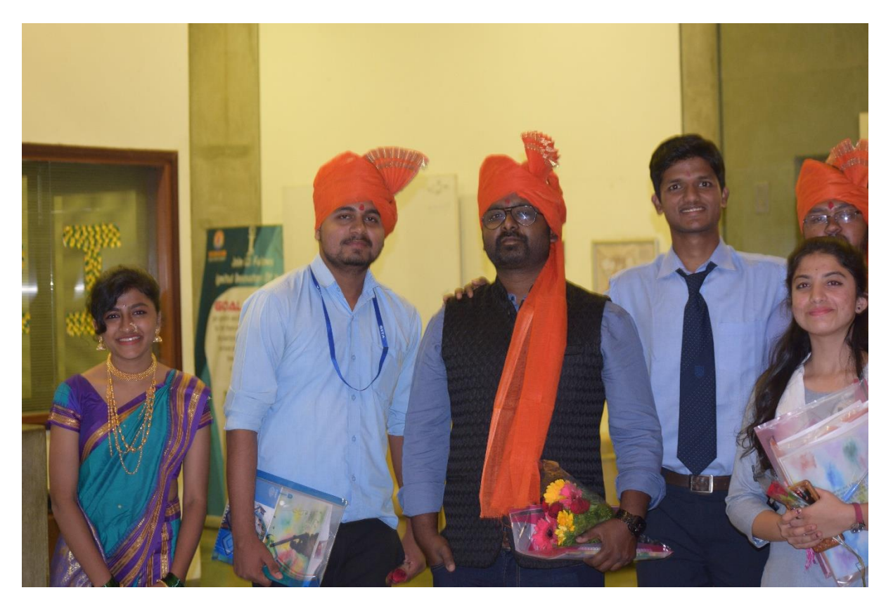
Inauguration Ceremony scenes